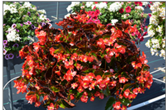
BabyWing Red Begonia in bloom