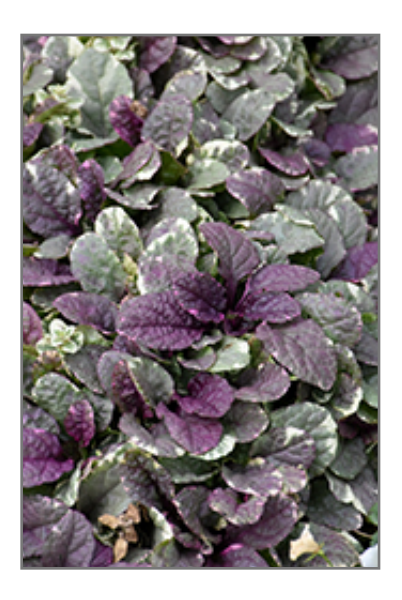
Burgundy Glow Bugleweed foliage