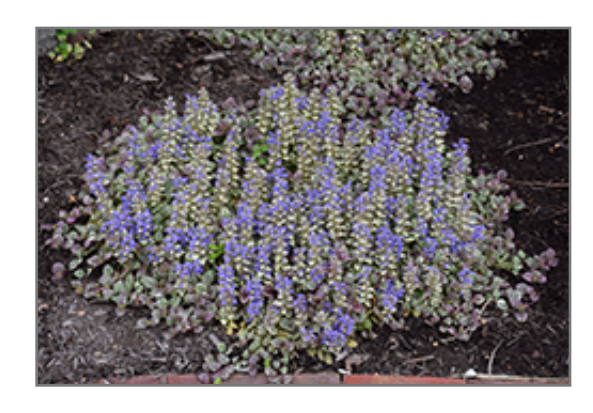
Burgundy Glow Bugleweed in bloom

Burgundy Glow Bugleweed is a fine choice for the garden, but it is also a good selection for planting in outdoor containers and hanging baskets. Because of its spreading habit of growth, it is ideally suited for use as a 'spiller' in the 'spiller-thriller-filler' container combination; plant it near the edges where it can spill gracefully over the pot. Note that when growing plants in outdoor containers and baskets, they may require more frequent waterings than they would in the yard or garden.