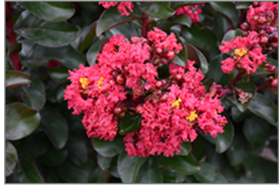
Cherry Mocha Crapemyrtle flowers

Cherry Mocha Crapemyrtle is recommended for the following landscape applications;