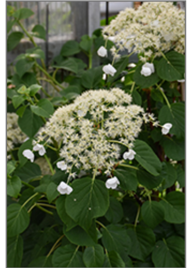
Climbing Hydrangea flowers