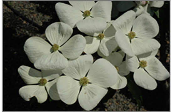
Starlight Flowering Dogwood flowers