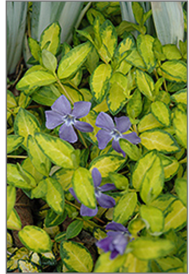
Illumination Periwinkle flowers

Illumination Periwinkle is recommended for the following landscape applications;