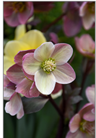
Pink Frost Hellebore flowers