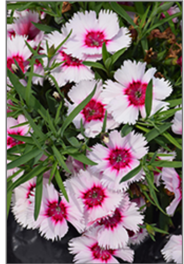
Super Parfait Raspberry Pinks flowers

Super Parfait Raspberry Pinks is a fine choice for the garden, but it is also a good selection for planting in outdoor pots and containers. It is often used as a 'filler' in the 'spiller-thriller-filler' container combination, providing a mass of flowers and foliage against which the thriller plants stand out. Note that when growing plants in outdoor containers and baskets, they may require more frequent waterings than they would in the yard or garden.