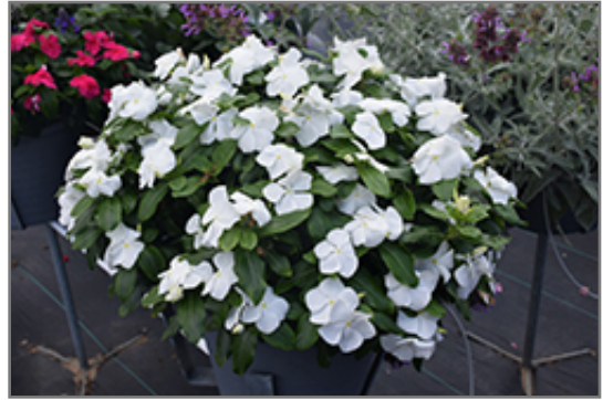
Titan Pure White Vinca in bloom

Titan Pure White Vinca will grow to be about 14 inches tall at maturity, with a spread of 12 inches. Its foliage tends to remain dense right to the ground, not requiring facer plants in front. Although it's not a true annual, this fast-growing plant can be expected to behave as an annual in our climate if left outdoors over the winter, usually needing replacement the following year. As such, gardeners should take into consideration that it will perform differently than it would in its native habitat.