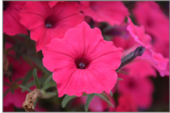
Supertunia Vista Fuchsia Petunia flowers