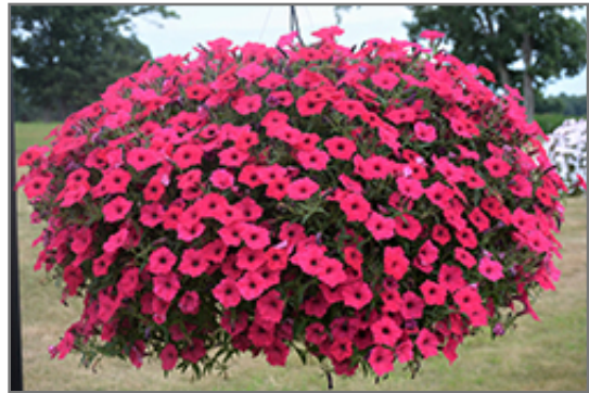
Supertunia Vista Fuchsia Petunia in bloom