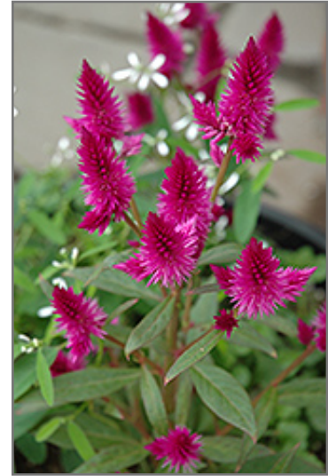
Intenz Classic Celosia flowers

Intenz Classic Celosia is recommended for the following landscape applications;