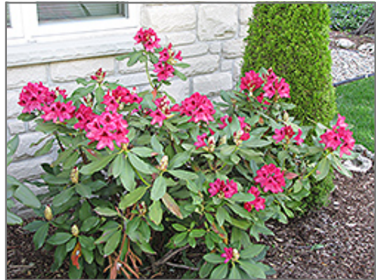
Nova Zembla Rhododendron in bloom