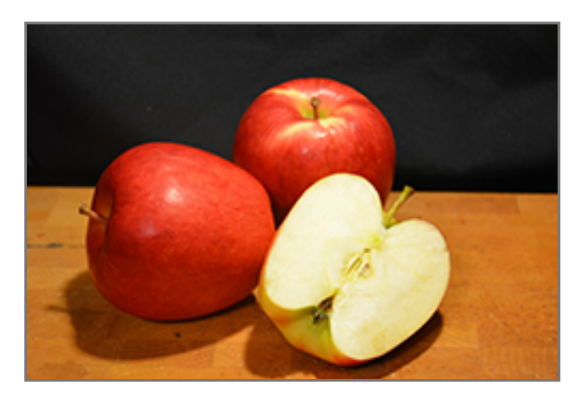
Ambrosia Apple fruit and flesh