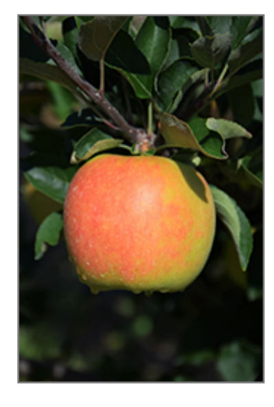
Ambrosia Apple fruit

Ambrosia Apple features showy clusters of lightly-scented white flowers with shell pink overtones along the branches in mid spring, which emerge from distinctive rose flower buds. It has forest green deciduous foliage. The pointy leaves turn yellow in fall. The fruits are showy red apples with a light green blush, which are carried in abundance in late summer. The fruit can be messy if allowed to drop on the lawn or walkways, and may require occasional clean-up.