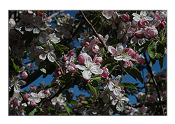
Ambrosia Apple flowers

This tree is typically grown in a designated area of the yard because of its mature size and spread. It should only be grown in full sunlight. It prefers to grow in average to moist conditions, and shouldn't be allowed to dry out. It is not particular as to soil type or pH. It is highly tolerant of urban pollution and will even thrive in inner city environments. This particular variety is an interspecific hybrid.