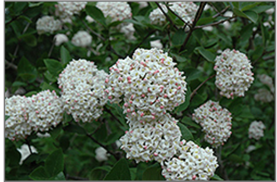
Fragrant Viburnum (tree form) flowers