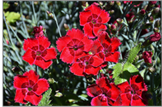
Fire Star Pinks flowers

This is a relatively low maintenance plant, and is best cleaned up in early spring before it resumes active growth for the season. It is a good choice for attracting bees and butterflies to your yard, but is not particularly attractive to deer who tend to leave it alone in favor of tastier treats. It has no significant negative characteristics.