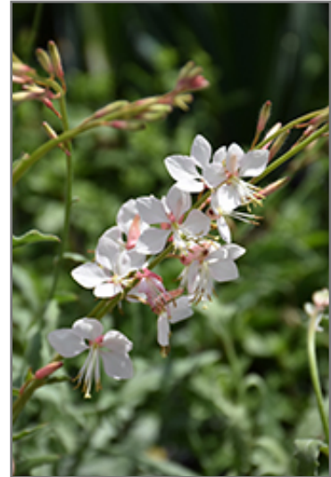
Whirling Butterflies Gaura flowers

This is a relatively low maintenance plant, and is best cleaned up in early spring before it resumes active growth for the season. It is a good choice for attracting butterflies to your yard, but is not particularly attractive to deer who tend to leave it alone in favor of tastier treats. It has no significant negative characteristics.