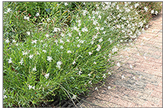
Whirling Butterflies Gaura in bloom