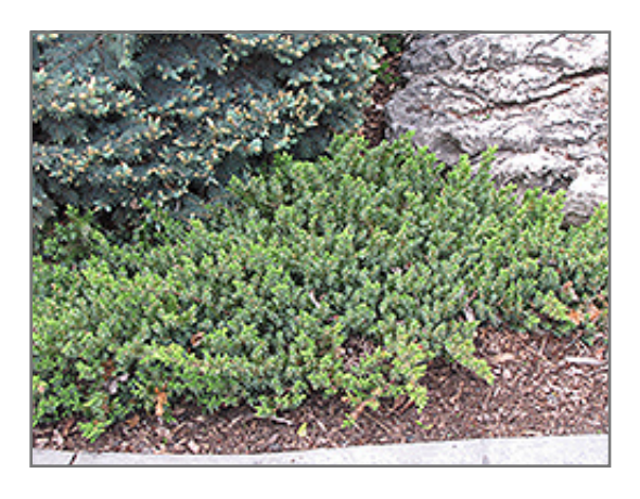
Dwarf Japanese Garden Juniper

This is a relatively low maintenance shrub, and is best pruned in late winter once the threat of extreme cold has passed. Deer don't particularly care for this plant and will usually leave it alone in favor of tastier treats. It has no significant negative characteristics.