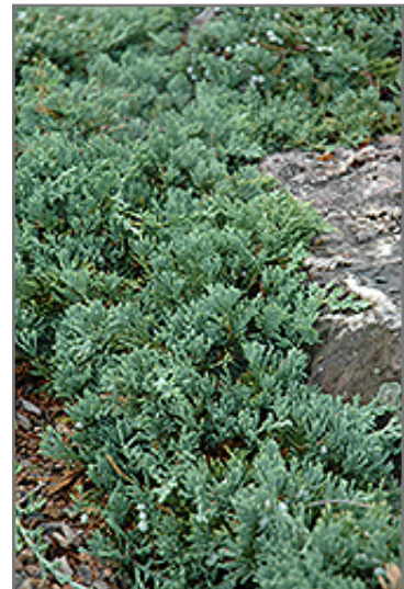
Blue Rug Juniper