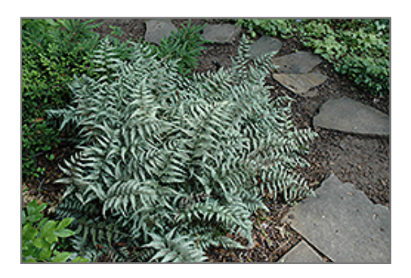
Japanese Painted Fern

684 South Pelham Road Welland, ON L3C 3C8 905-735-5744 vermeers.ca