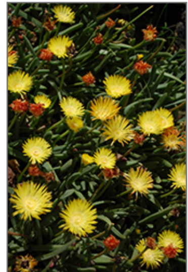
Yellow Ice Plant flowers