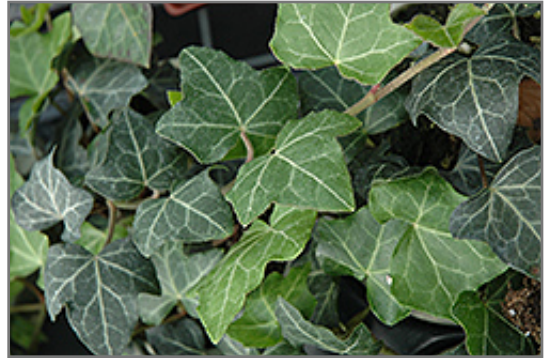
Baltic Ivy foliage