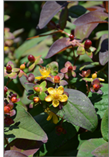
Albury Purple St. John's Wort flowers