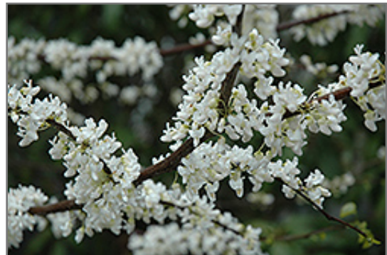
White Redbud flowers