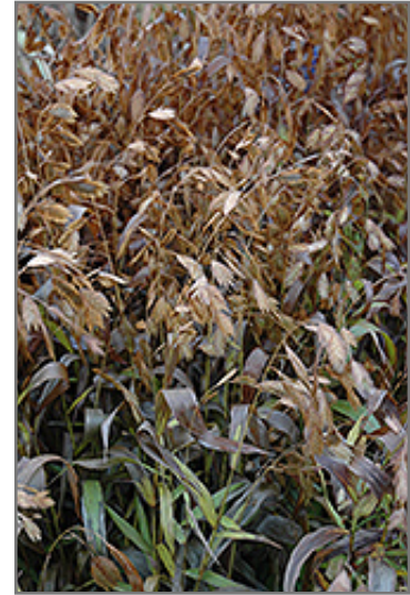
Northern Sea Oats in fall

Northern Sea Oats is recommended for the following landscape applications;