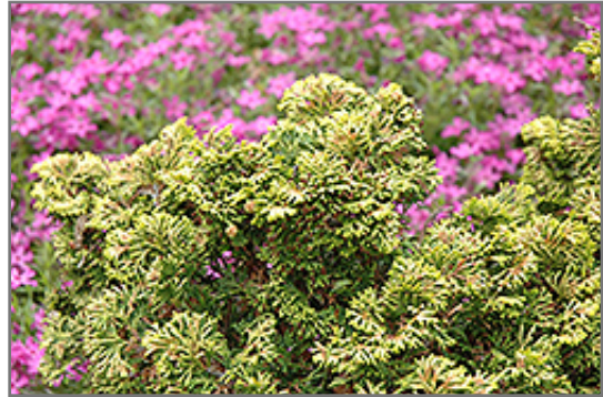
Verdon Dwarf Hinoki Falsecypress foliage