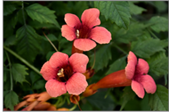
Flamenco Trumpetvine flowers

This is a high maintenance woody vine that will require regular care and upkeep, and can be pruned at anytime. It is a good choice for attracting birds and hummingbirds to your yard, but is not particularly attractive to deer who tend to leave it alone in favor of tastier treats. Gardeners should be aware of the following characteristic(s) that may warrant special consideration;