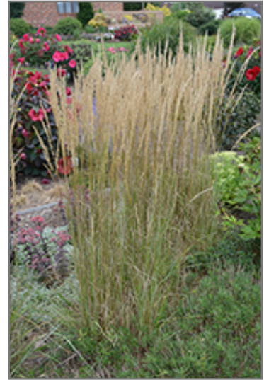
El Dorado Feather Reed Grass

El Dorado Feather Reed Grass is recommended for the following landscape applications;