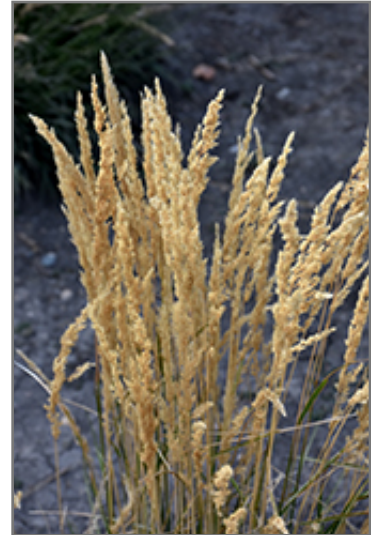
El Dorado Feather Reed Grass fruit

El Dorado Feather Reed Grass is a fine choice for the garden, but it is also a good selection for planting in outdoor pots and containers. Because of its height, it is often used as a 'thriller' in the 'spiller-thriller-filler' container combination; plant it near the center of the pot, surrounded by smaller plants and those that spill over the edges. It is even sizeable enough that it can be grown alone in a suitable container. Note that when growing plants in outdoor containers and baskets, they may require more frequent waterings than they would in the yard or garden.