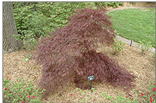
Purple-Leaf Threadleaf Japanese Maple