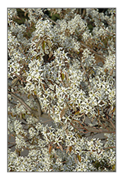
Shadblow Serviceberry flowers

This shrub does best in full sun to partial shade. It is quite adaptable, prefering to grow in average to wet conditions, and will even tolerate some standing water. It is not particular as to soil type or pH. It is somewhat tolerant of urban pollution. This species is native to parts of North America.