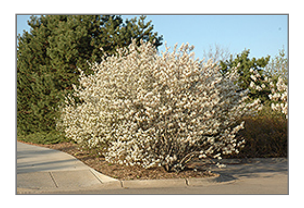
Shadblow Serviceberry in bloom

Shadblow Serviceberry is a multi-stemmed deciduous shrub with an upright spreading habit of growth. Its average texture blends into the landscape, but can be balanced by one or two finer or coarser trees or shrubs for an effective composition.