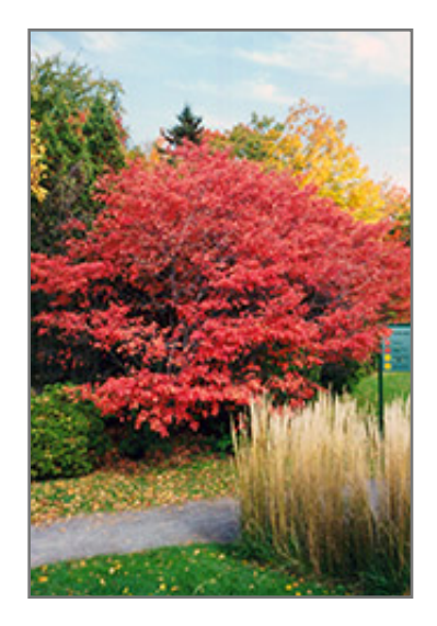
Shadblow Serviceberrv in fall

684 South Pelham Road Welland, ON L3C 3C8 905-735-5744 vermeers.ca