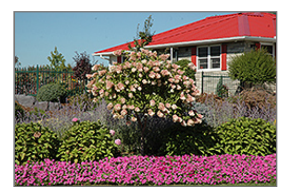
Tree Form Pee Gee Hydrangea in bloom