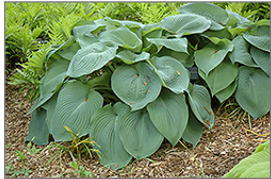
Big Daddy Hosta

Big Daddy Hosta is recommended for the following landscape applications;