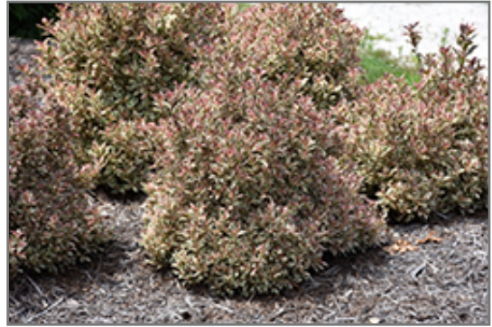
My Monet Weigela

My Monet Weigela makes a fine choice for the outdoor landscape, but it is also well-suited for use in outdoor pots and containers. It is often used as a 'filler' in the 'spiller-thriller-filler' container combination, providing a mass of flowers and foliage against which the thriller plants stand out. Note that when grown in a container, it may not perform exactly as indicated on the tag - this is to be expected. Also note that when growing plants in outdoor containers and baskets, they may require more frequent waterings than they would in the yard or garden.