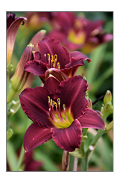
Ruby Stella Daylily flowers