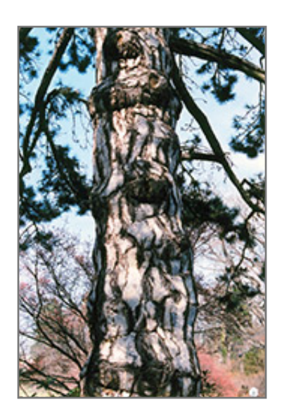
Austrian Pine bark