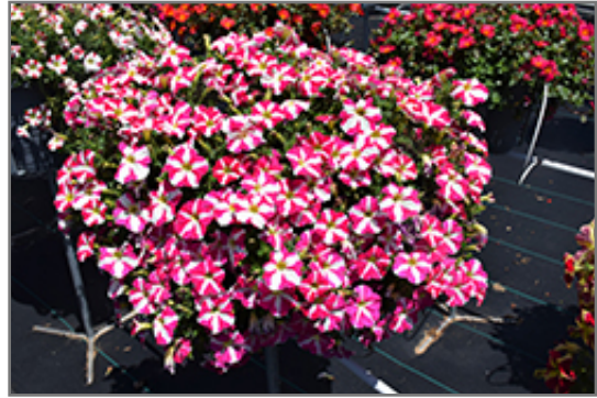
Amore Pink Heart Petunia in bloom

Amore Pink Heart Petunia will grow to be about 12 inches tall at maturity, with a spread of 14 inches. When grown in masses or used as a bedding plant, individual plants should be spaced approximately 10 inches apart. Its foliage tends to remain dense right to the ground, not requiring facer plants in front. This fast-growing annual will normally live for one full growing season, needing replacement the following year.