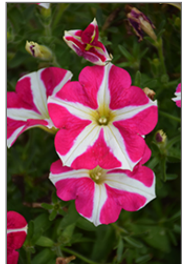
Amore Pink Heart Petunia flowers