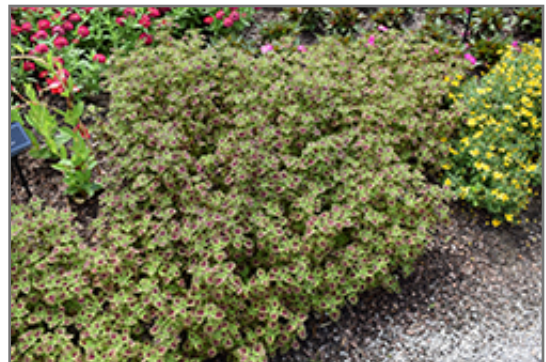
ColorBlaze Chocolate Drop Coleus