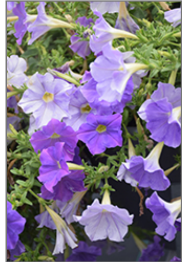
Supertunia Blue Skies Petunia flowers

Supertunia Blue Skies Petunia is recommended for the following landscape applications;