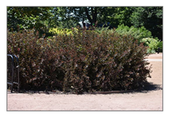
Summer Wine Black Ninebark

684 South Pelham Road Welland, ON L3C 3C8 905-735-5744 vermeers.ca