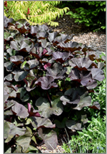
Britt Marie Crawford Rayflower foliage

This plant does best in partial shade to shade. It prefers to grow in moist to wet soil, and will even tolerate some standing water. It is not particular as to soil pH, but grows best in rich soils. It is somewhat tolerant of urban pollution. This is a selected variety of a species not originally from North America. It can be propagated by division; however, as a cultivated variety, be aware that it may be subject to certain restrictions or prohibitions on propagation.