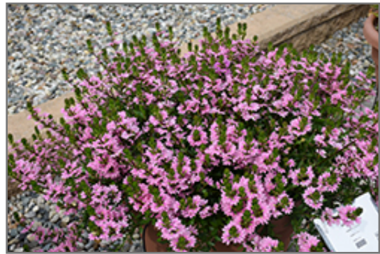
Whirlwind Pink Fan Flower in bloom