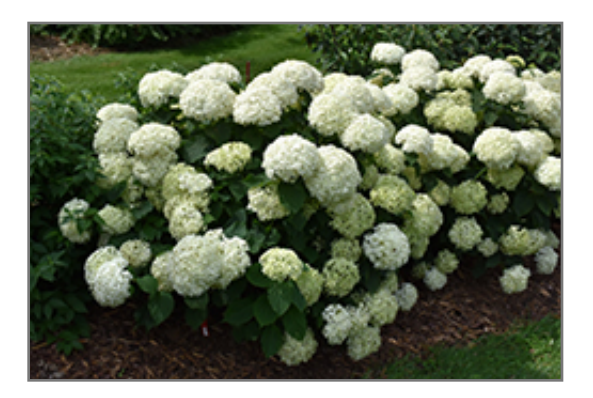
Invincibelle Limetta Hydrangea in bloom

684 South Pelham Road Welland, ON L3C 3C8 905-735-5744 vermeers.ca