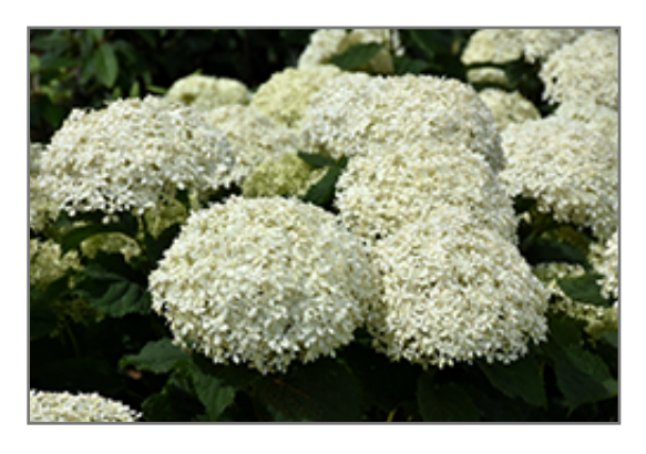
Invincibelle Limetta Hydrangea flowers