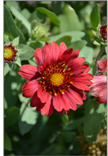
Mesa Red Blanket Flower flowers

Mesa Red Blanket Flower is recommended for the following landscape applications;