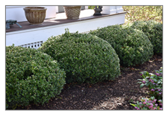
Sprinter Boxwood

This shrub does best in full sun to partial shade. You may want to keep it away from hot, dry locations that receive direct afternoon sun or which get reflected sunlight, such as against the south side of a white wall. It prefers to grow in average to moist conditions, and shouldn't be allowed to dry out. It is not particular as to soil type or pH. It is highly tolerant of urban pollution and will even thrive in inner city environments, and will benefit from being planted in a relatively sheltered location. This is a selected variety of a species not originally from North America.