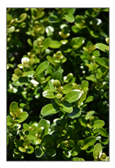
Sprinter Boxwood foliage

684 South Pelham Road Welland, ON L3C 3C8 905-735-5744 vermeers.ca