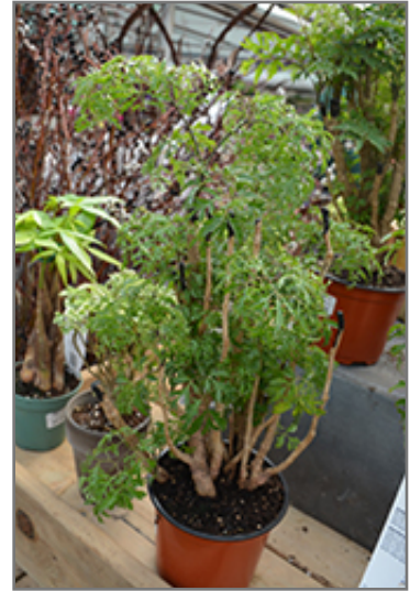
Ming Aralia

When grown indoors, Ming Aralia can be expected to grow to be about 6 feet tall at maturity, with a spread of 3 feet. It grows at a slow rate, and under ideal conditions can be expected to live for approximately 20 years. This houseplant should be situated in a location that that gets indirect sunlight at most, although it will usually require a more brightly-lit environment than what artificial indoor lighting alone can provide. It prefers dry to average moisture levels with very well-drained soil, and may die if left in standing water for any length of time. This plant should be watered when the surface of the soil gets dry, and will need watering approximately once each week. Be aware that your particular watering schedule may vary depending on its location in the room, the pot size, plant size and other conditions; if in doubt, ask one of our experts in the store for advice. It is particular about its soil conditions, with a strong preference for rich, acidic soil. Contact the store for specific recommendations on pre-mixed potting soil for this plant.