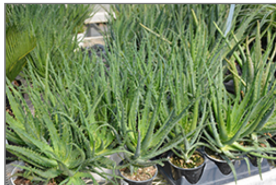
Aloe Vera