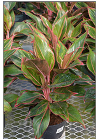
Siam Aurora Chinese Evergreen in full