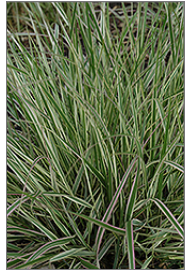
Variegated Reed Grass foliage