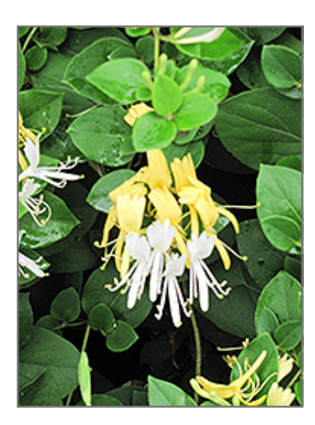
Hall's Japanese Honeysuckle flowers