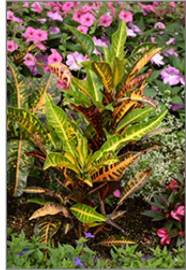
Variegated Croton