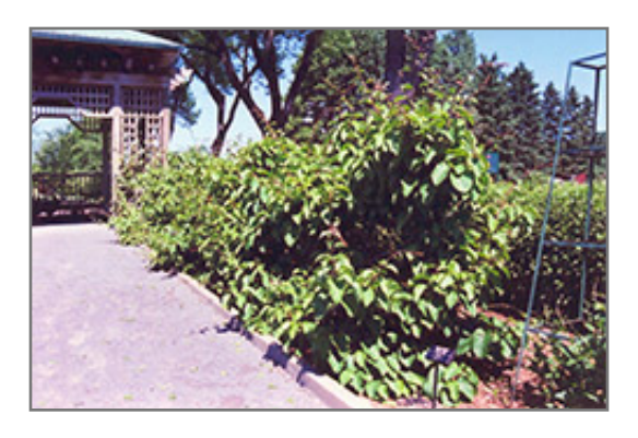
Issai Hardy Kiwi